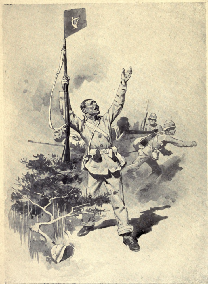
THE GREEN FLAG.